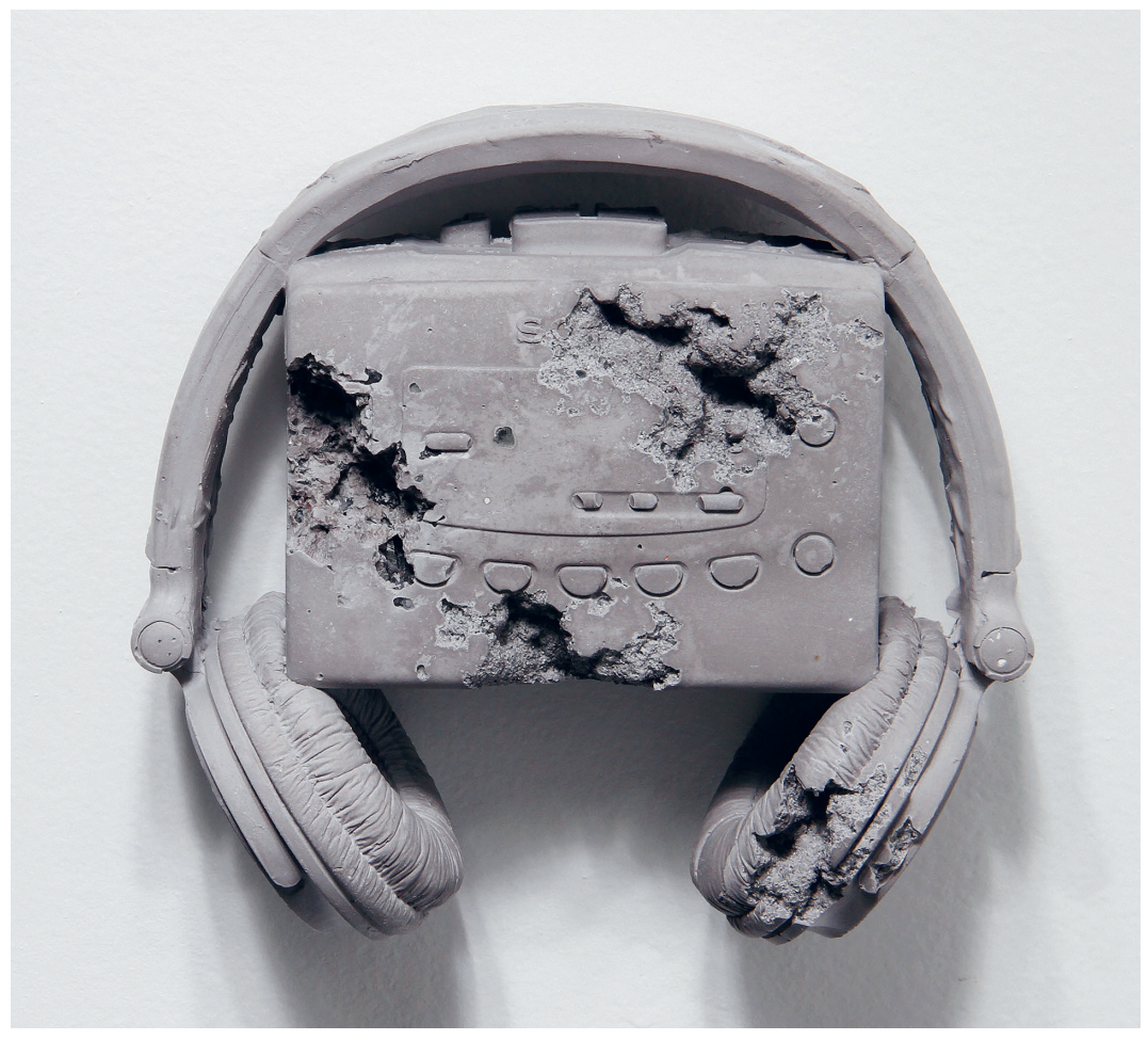
FIG. 2 Daniel Arsham, Ash Eroded Walkman, 2014. Volcanic ash, volcanic glass, hydrostone, metal. 16.5x7.518cm, Unique #30315. © Courtesy Galerie Perrotin and the Artist.

Like Mercier's imagined Paris in the year 2440, Arsham's objects exist in the future version of our present—the after which makes tangible the presence of a before . This overlapping of the past and the present, looking forward by looking backward, thus makes Arsham's sculptures an ideal prism to address this themed issue's call for reflections on aesthetic consequences of moments of anticipation and retrospection.