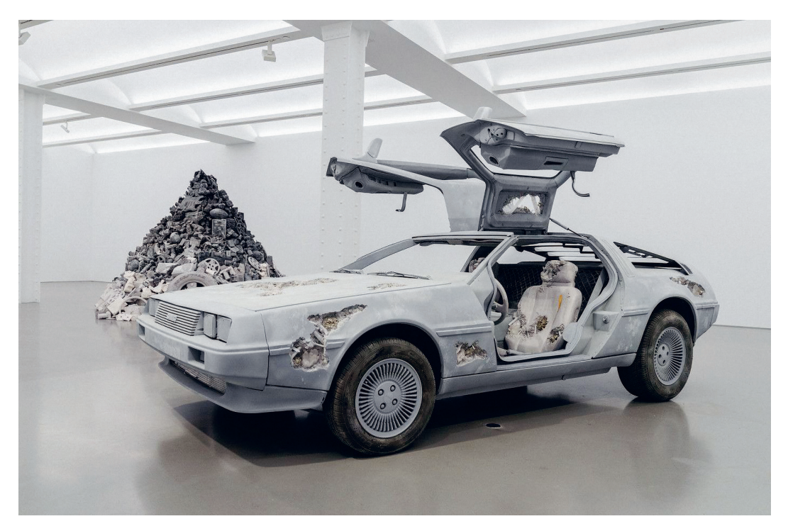
FIG. 6 \quad \text{Daniel Arsham, } \textit{Eroded Delorean, 2018, Stainless steel, glass reinforced plastic, quartz crystal, pyrite, paint, \\ 114 \times 421.6 \times 185.7 \text{ cm, Unique $\sharp 37636.} \\ \textcircled{Courtesy Galerie Perrotin and the Artist.}