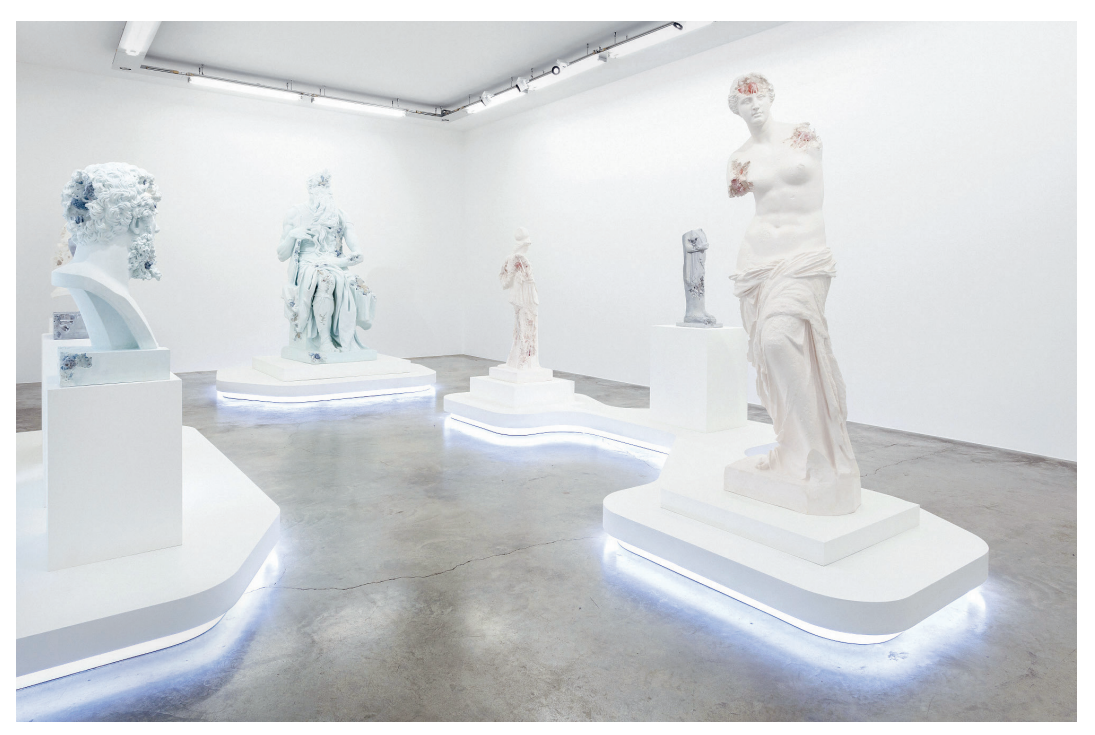
FIG. 3 Daniel Arsham, View of the exhibition "Paris, 3020" at Perrotin Paris, 2020.