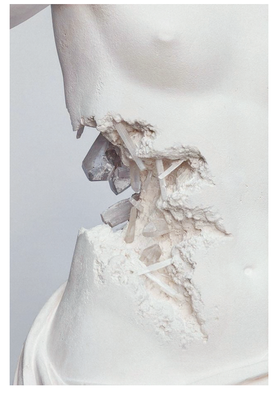
FIG. 5 Daniel Arsham, Quartz Eroded Venus of Arles [Detail], 2019, Quartz, selenite, hydrostone, 208×102×74 cm. Unique #50746. © Courtesy Galerie Perrotin and the Artist. Photographer: Claire Dorn.