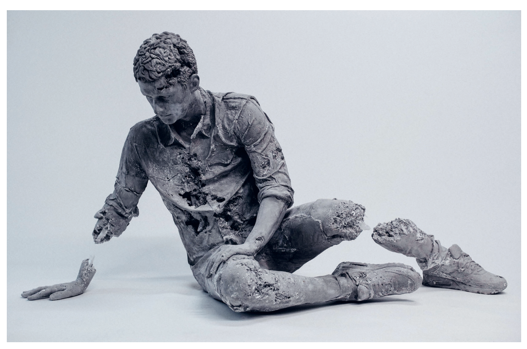
FIG. 7 \quad \text{Daniel Arsham, } \textit{The Dying Gaul Revisited, } 2015. \ Selenite, \ \text{hydrostone, } 90 \times 170 \times 80 \ \text{cm, Unique } \sharp 34279. \