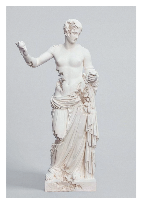
\begin{array}{ll} {\rm FIG.\,4} & {\rm Daniel\,Arsham},\,{\it Quartz\,Eroded\,Venus\,of\,Arles},\,2019,\\ {\rm Quartz},\,\,{\rm selenite},\,\,{\rm hydrostone},\,\,208\times102\times74\,\,{\rm cm}.\\ {\rm Unique\,\#50746}.\,@\,\,{\rm Courtesy\,Galerie\,Perrotin\,and\,the}\\ {\rm Artist.\,Photographer:\,Claire\,Dorn.} \end{array}