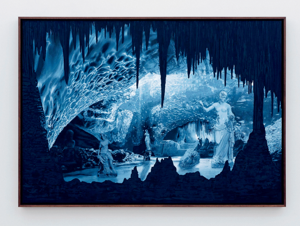
FIG. 8 Daniel Arsham, Cave of the Sublime, Iceland, 2020, Unframed: 213.5×305.4 cm. Acrylic on canvas. Unique #55240. © Courtesy Galerie Perrotin and the Artist. Photographer: Guillaume Ziccarelli.

As an artistic strategy in the visual arts, fictional archaeology as is grounded in the tradition of the capricci, originally a subgenre of landscape painting of architectural fantasies that prized picturesque compositions over topographical accuracy. For the exhibition Time Dilation (2021), Arsham included paintings that were visually and conceptually inspired by early modern capricci as well as German Romanticism. The Cave of the Sublime. Iceland (2020; Fig. 8), which he identified as a future vision of the year 12,000, features a blue chiaroscuro maw of a cave populated with his own sculptures, all displaying the telltale chiseled erosions replete with crystals.<sup>24</sup> The darkened foreground is akin to a cartouche; the naturally occurring stalactites and stalagmites frame his painted sculptures and obfuscate the age of the crystalline erosions. The base of the Venus of Arles appears to be fused with the cave, seemingly surrendering to the ecosystem of growth and decay in the cavern. Of the ten paintings exhibited in Time Dilation, four of them feature the Venus of Arles, further complicating the levels of decay and temporal transformation. The exhibition title compounds his temporal manipulations, as "time dilation" is the scientific term for the phenomenon, described by Einstein's Theory of Relativity, in which time ticks at different rates for a stationary observer and one in relative motion.